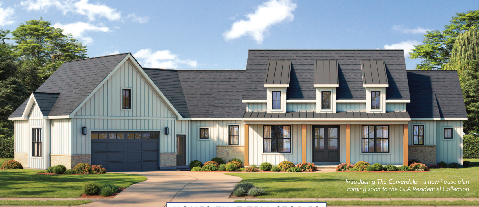
Introducing The Carverdale – a new house plan coming soon to the GLA Residential Collection