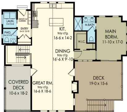
FIRST FLOOR PLAN Scale: N.T.S. Living Area = 1380 Sq. Ft. 9'-0" Ceiling Height