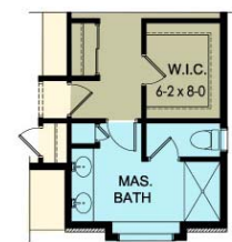
ALT. M.BATH LAYOUT

*** Images shown may differ from final construction documents. ***